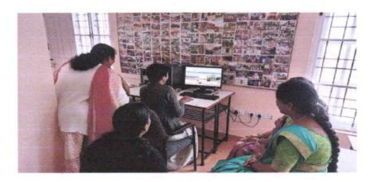
23.11.21 Meeting with Sr. Principal, IQAC members & DQAC members to discuss about AQAR and NIRF data uploading.