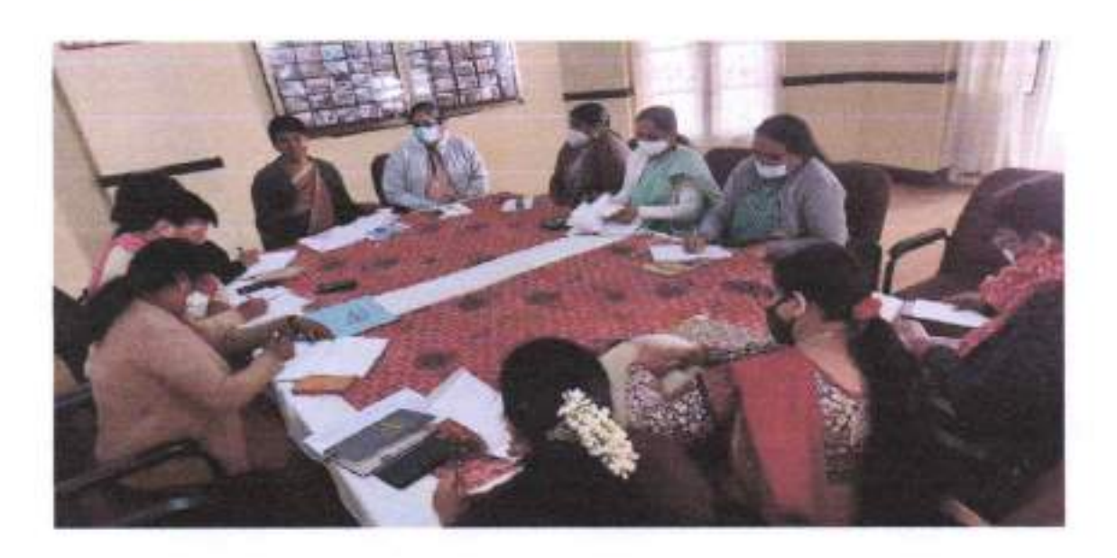
15.02.22 IQAC Committee Meeting.