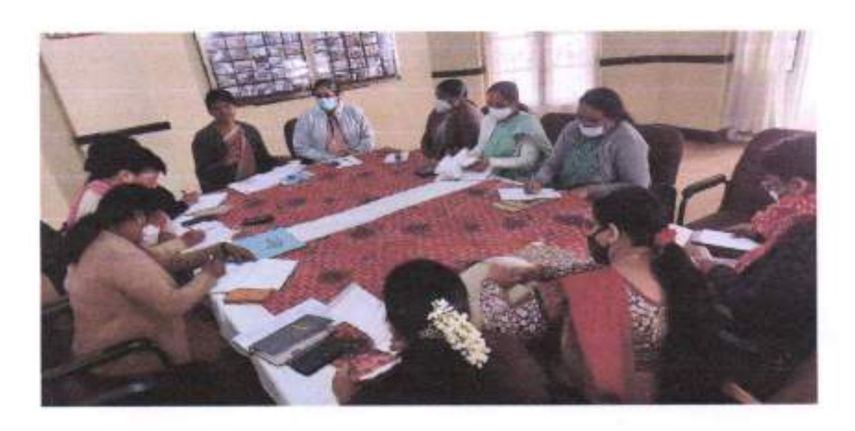
15.02.22 IQAC Committee Meeting.