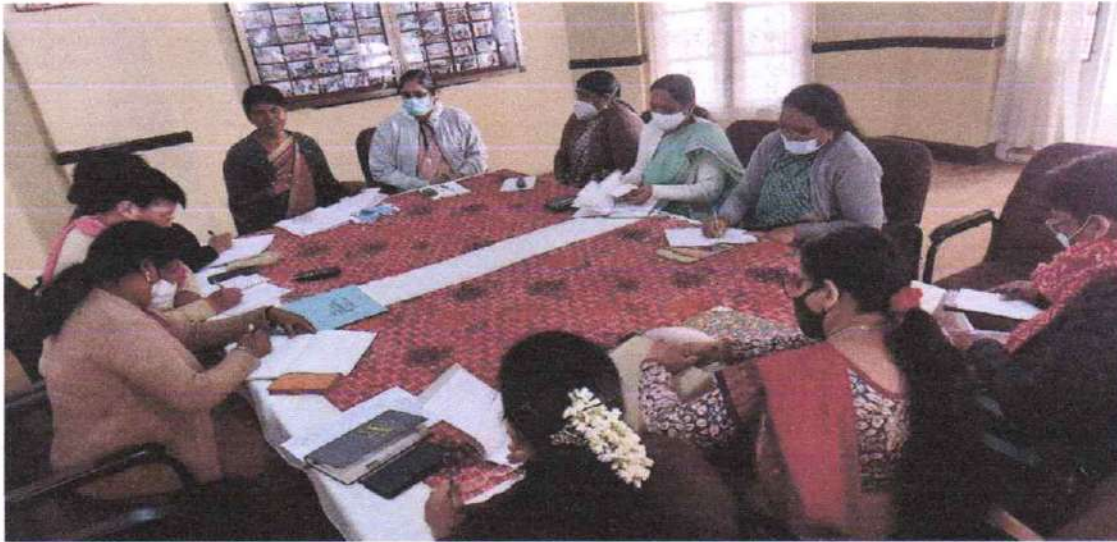
15.02.22 IQAC Committee Meeting.