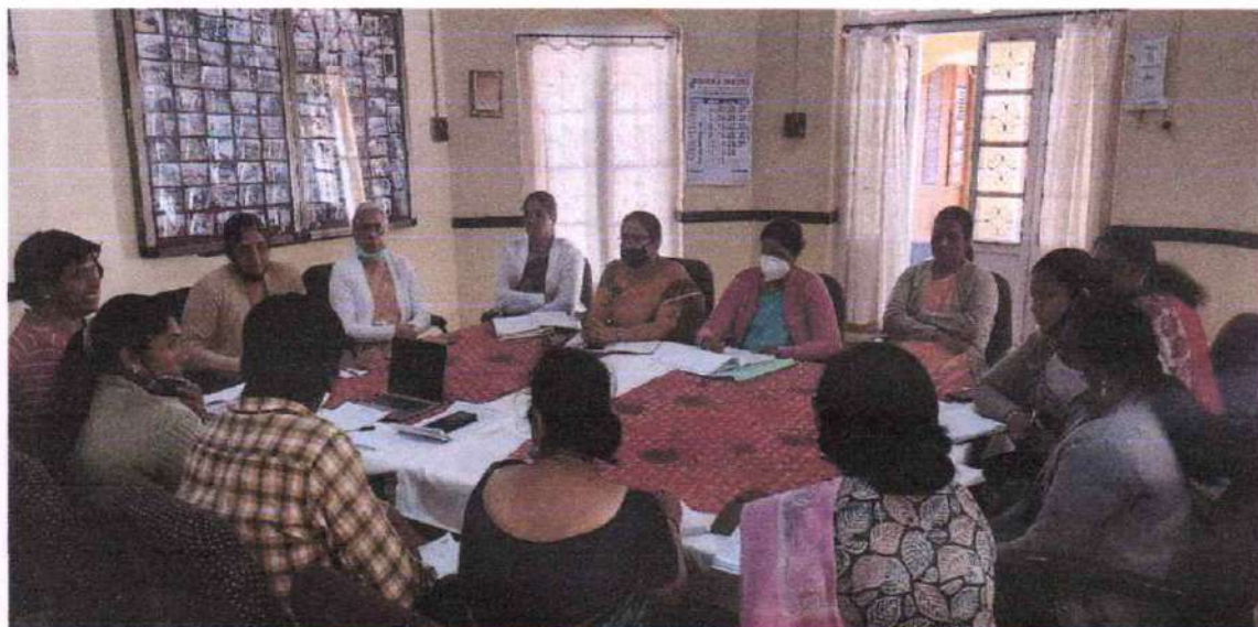
23.03.22 Meeting with Sr. Secretary, Sr. Principal, IQAC committee & administrative staff members.